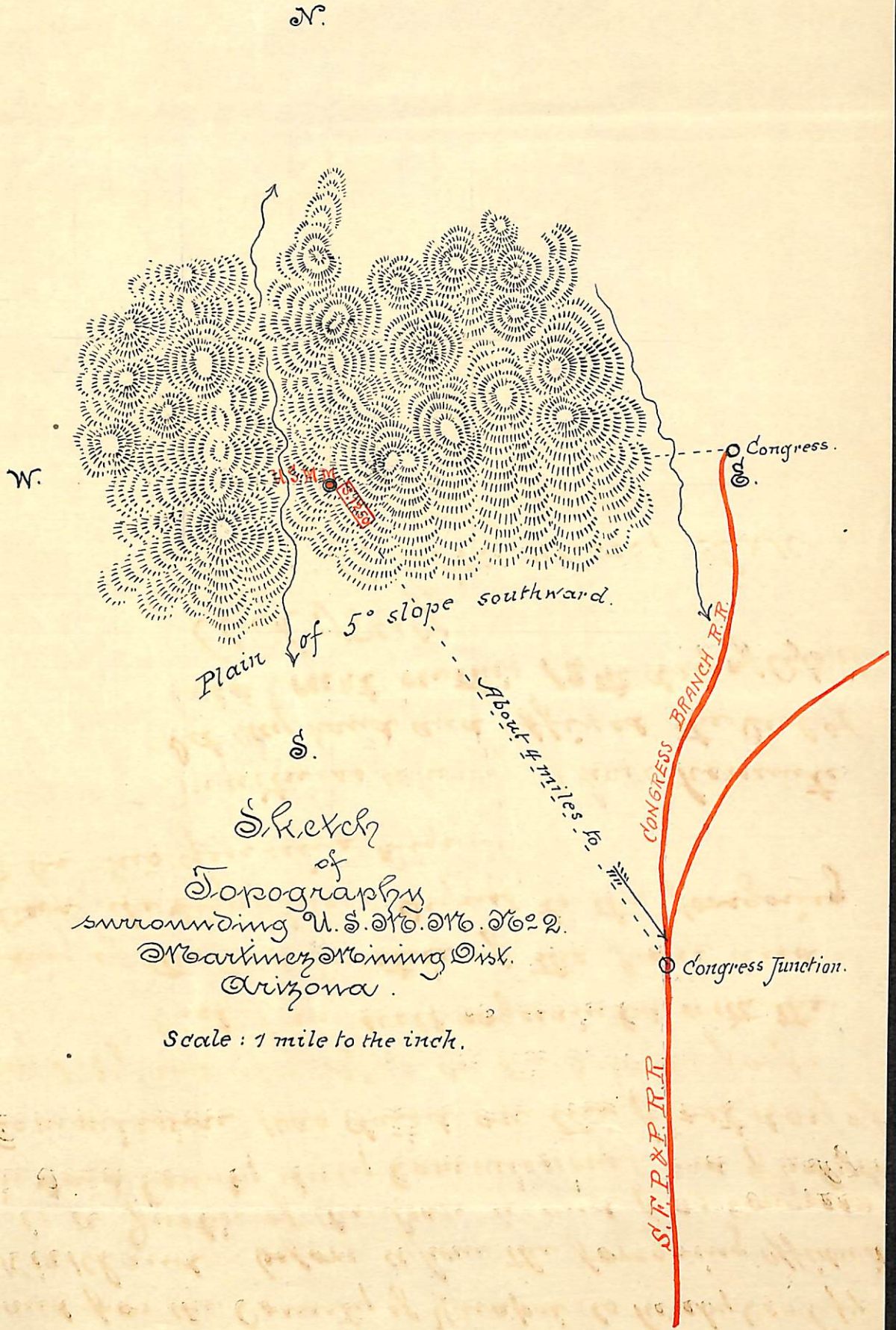
Sketch of Topography surrounding U. S. Mc. No. 2. Martinez Mining Dist. Arizona.