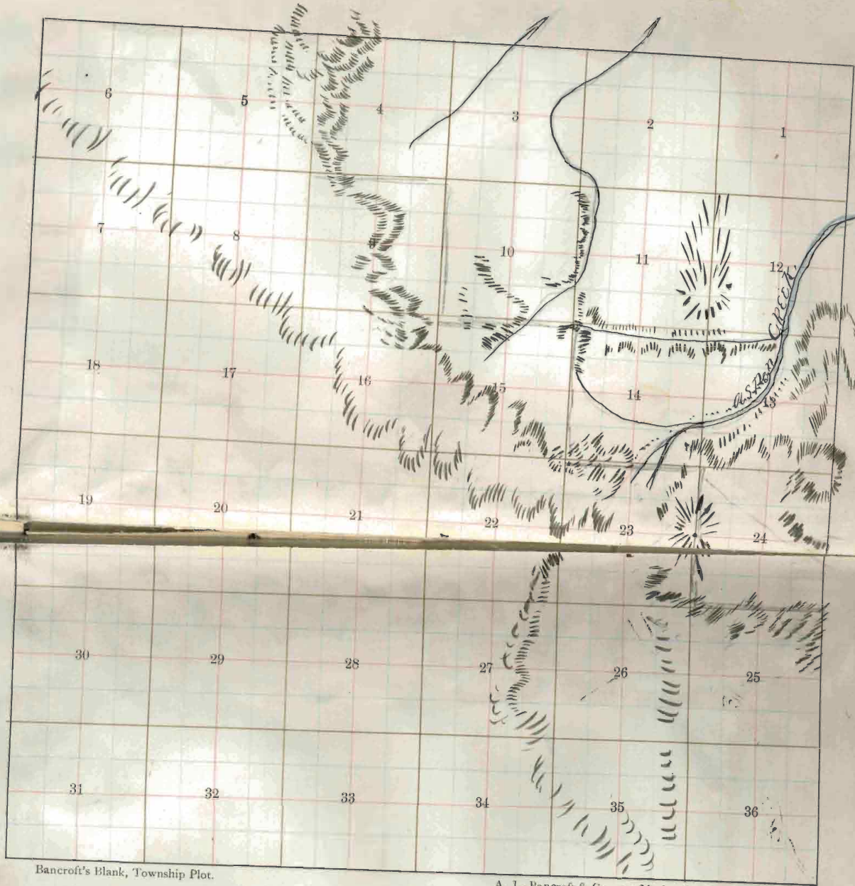
Bancroft's Blank, Township Plot.

A. L. Bancroft & Co., 721 Market St., San Francisco.